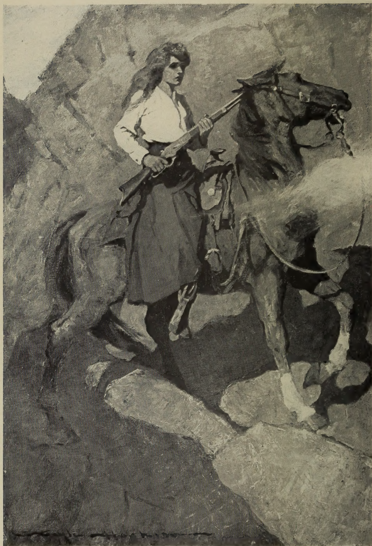
When a shot suddenly rang out